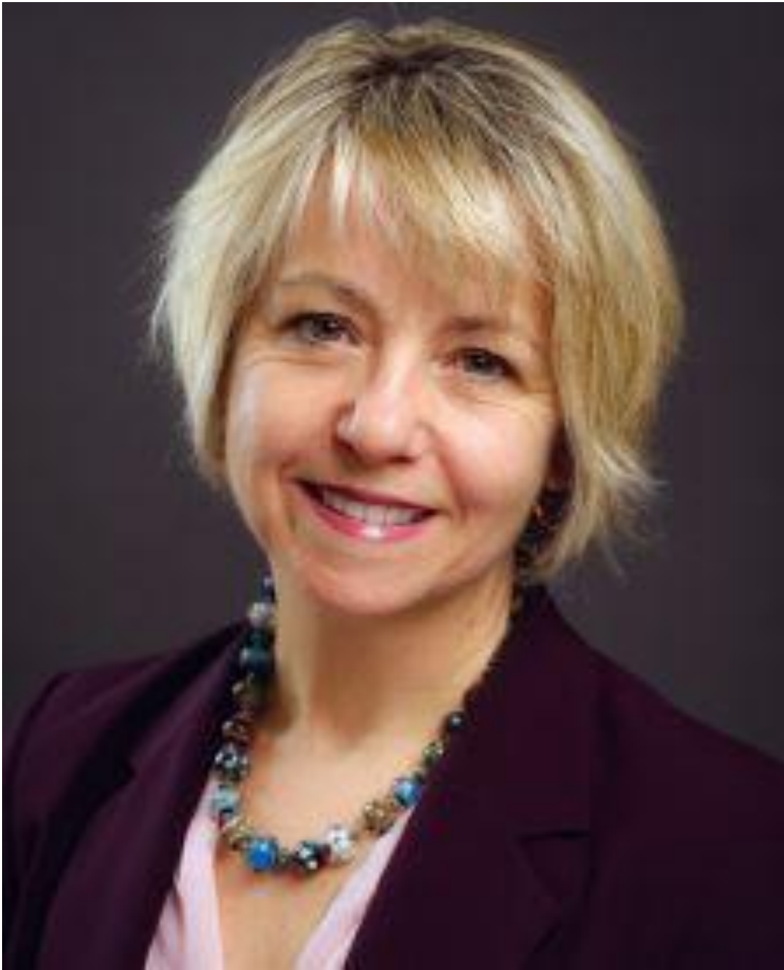
Dr. Bonnie Henry First Female Provincial Health Officer for BC